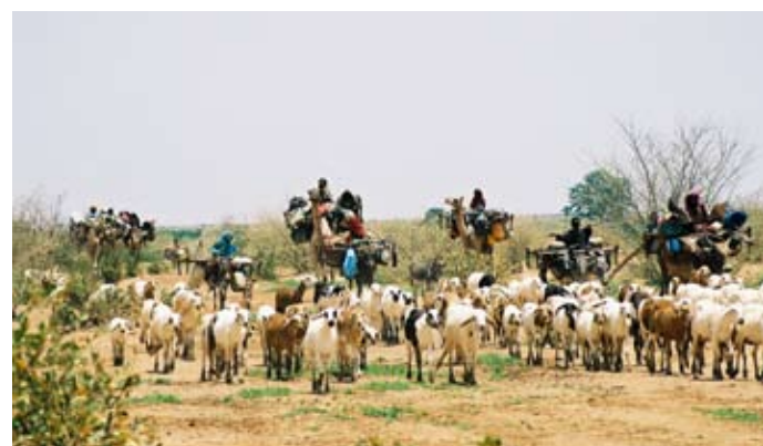
Pastoralists from South Kordofan, Sudan, arriving in neighbouring North Kordofan for wet-season grazing.

In recent years some governments have shown greater awareness of the importance of livestock mobility for dryland ecosystems. New legislation in Burkina Faso, Guinea, Mali and Mauritania sets out pastoralists' rights to move their animals within and across national borders. However, government officials' limited understanding of pastoral systems means that this legislation is likely to be implemented in an unduly technocratic and centralised way, thus in practice continuing to curtail mobility. Moreover, while the various regional integration processes across Africa permit the free movement of people and goods, pastoralists still face many practical difficulties when moving their animals across borders.